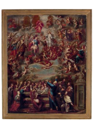
NICOLÁS ENRÍQUEZ (1704-C.1790) The Assumption of the Virgin oil on copper Painted in 1744. $200,000-300,000

PRESS CONTACT: Jennifer Cuminale | 212 636 2680 | jcuminale@christies.com