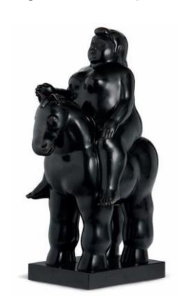
FERNANDO BOTERO (B. 1932) Woman on a Horse bronze, Edition five of six. $300,000-400,000