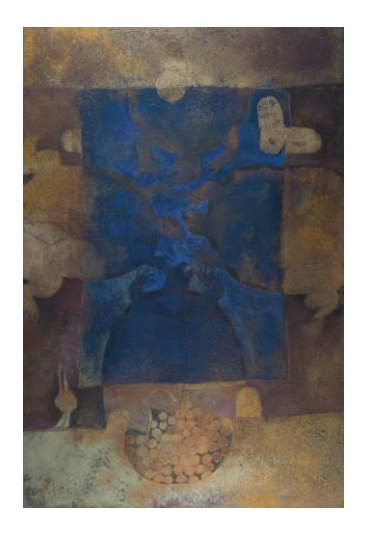
PROPERTY FROM A NOTABLE FAMILY COLLECTION FRANCISCO TOLEDO (B. 1940) Tortuga poniendo huevos oil and sand on canvas Painted in 1973. $900,000-1,200,000